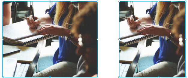
dragging only the frame handles to a smaller size reduces image display, but does not actually alter the image itself.